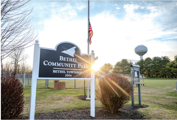
Pictured: The golden hour at Bethel Community Park.