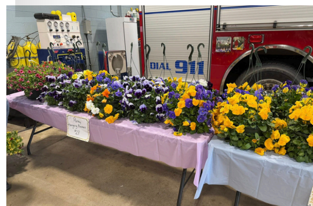
Pictured: Annual Easter Plant Sale hosted by Bethel Township Hose Company #1 held in April 2026.

Interested in volunteering with the Bethel Fire Company? Visit www.bethelfire.com or email info@bethelfire.com to learn more.