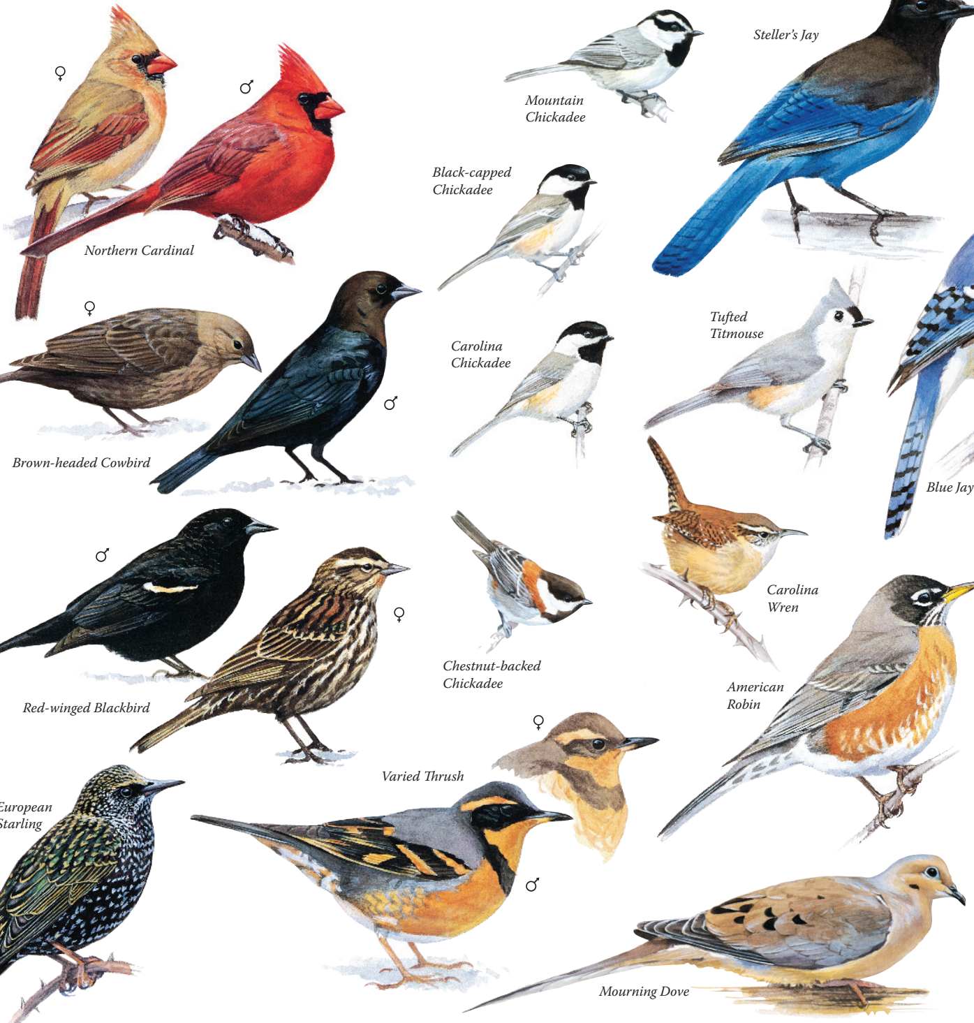
Illustrations of birds commonly found at feeders in winter by Larry McQueen for Project FeederWatch. Birds shown in winter plumage at approximately one-fourth life size. Project FeederWatch is a joint research and education project of the Cornell Lab of Ornithology and Birds Canada.

Participation fee is $18 in the U.S. or a donation of any amount in Canada.