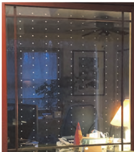
Feather Friendly® Do-it-yourself Tape

Visit the Acopian BirdSavers website for plans or to order them custom made for your windows.